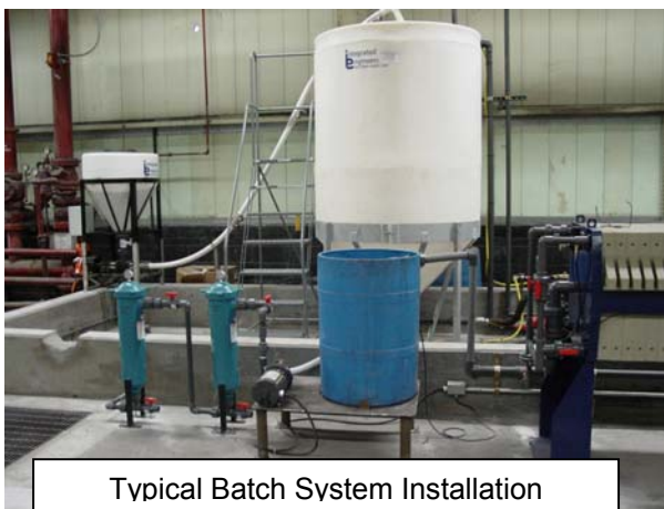
Typical Batch System Installation